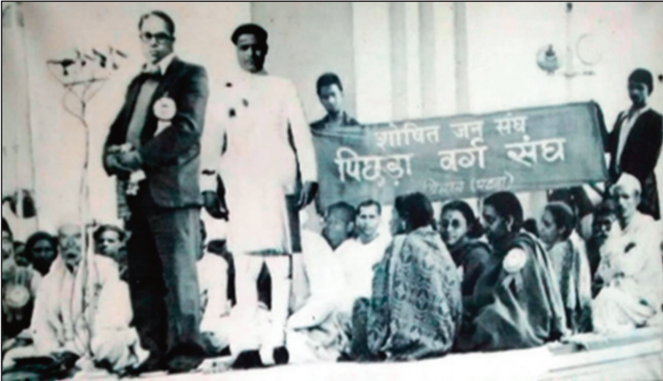
Dr. Ambedkar at Patna Meeting

mentioned in the policy that the party would give priority to the alliance with the parties representing the backward castes and tribes and if necessary, the party would Will change its name to "Backward Classes Federation" to represent the backward classes. Therefore, the party had also made an electoral alliance with the Socialist Party at that time.